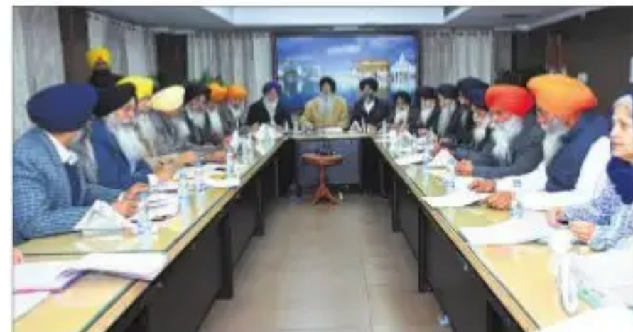
SGPC executive members at a meeting in Amritsar.